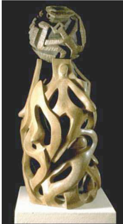
Renato Dorfman: "Children in Clay Creating a Metallic World" - Sculpture Ceramic, 1997